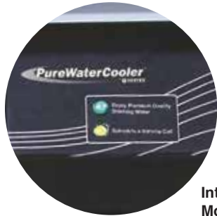
Integrated Filter Monitor