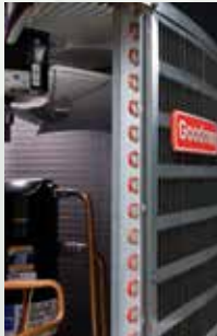
Goodman's SMARTCOIL 5mm tube condensing coil design optimizes the heat transfer ability of R-410A refrigerant compared to standard 3/8" copper tubing.

We know that the last thing you want to hear at night is a noisy heat pump starting up. So we build our Goodman brand SSZ14 Heat Pumps with sound-dampening features that help ensure that your cooling system doesn't interfere with a good night's sleep. We rely on a quiet condenser fan system – a three-bladed fan and a unique louvered sound-control top – to reduce fan-related noise. Your Goodman brand SSZ14 Heat Pump will keep your home cool and comfortable, year after year.